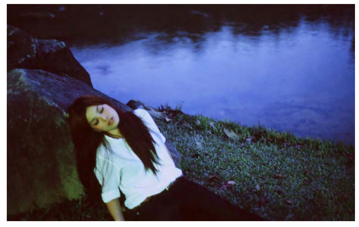
www.raisedasapackofwolves.com © Genevieve Chua