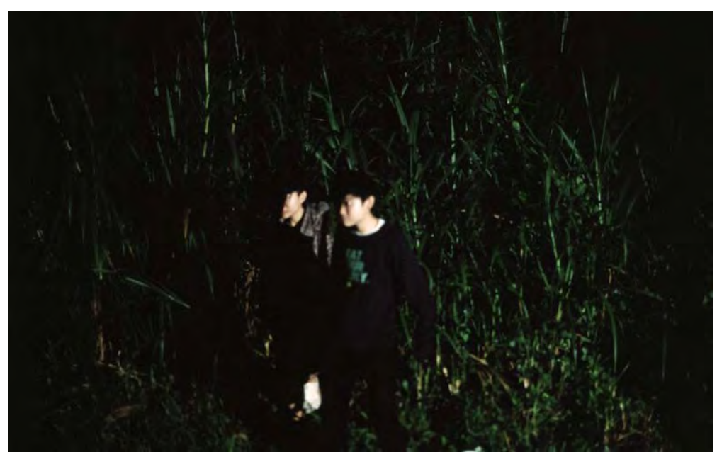
www.raisedasapackofwolves.com © Genevieve Chua