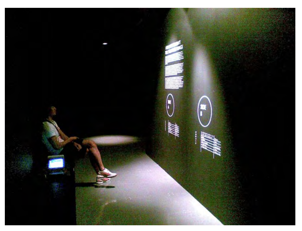
Mixtape listening station behind the diorama