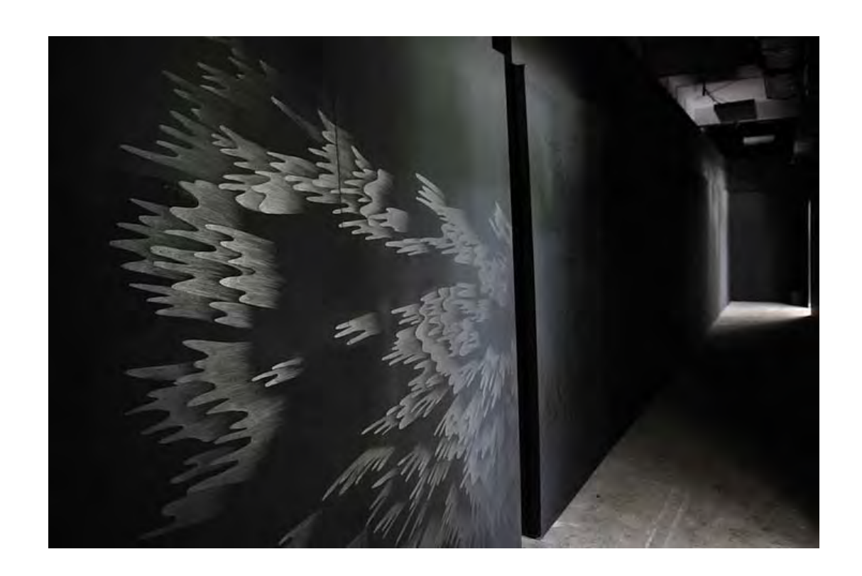
Medium: Graphite on Black Panels; Video on loop (15min)