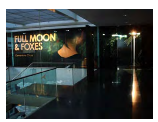
Exterior of Atelier Gallery