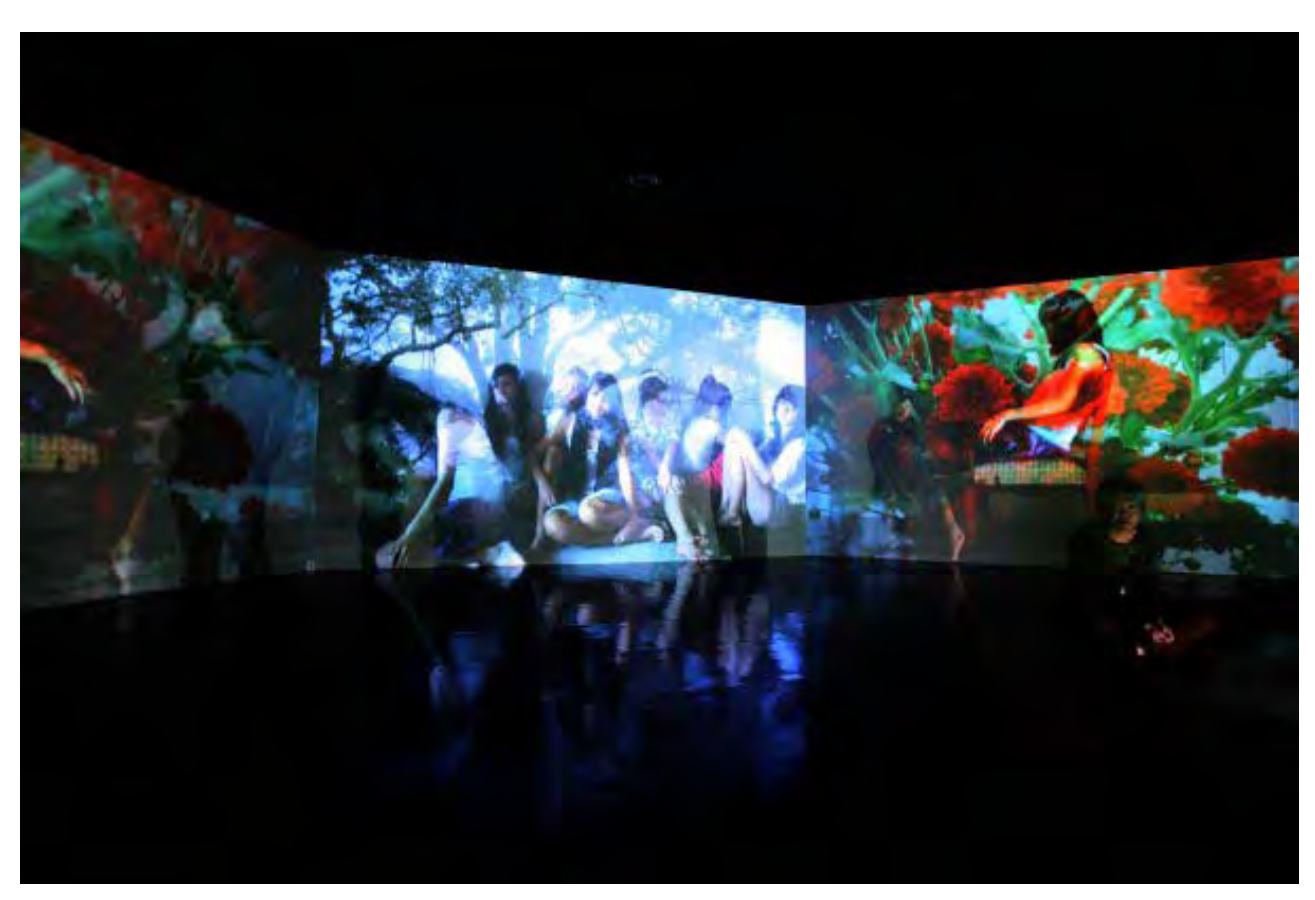
3-channel video projection on 3-screen diorama duration: 15 minutes