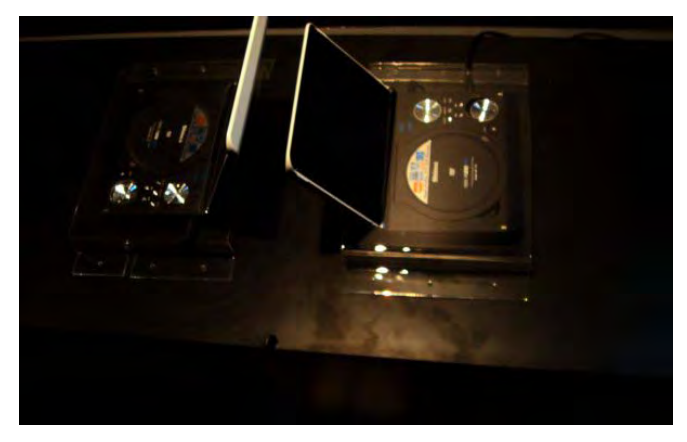
Audio players which plays Side A and Side B of the mixtape