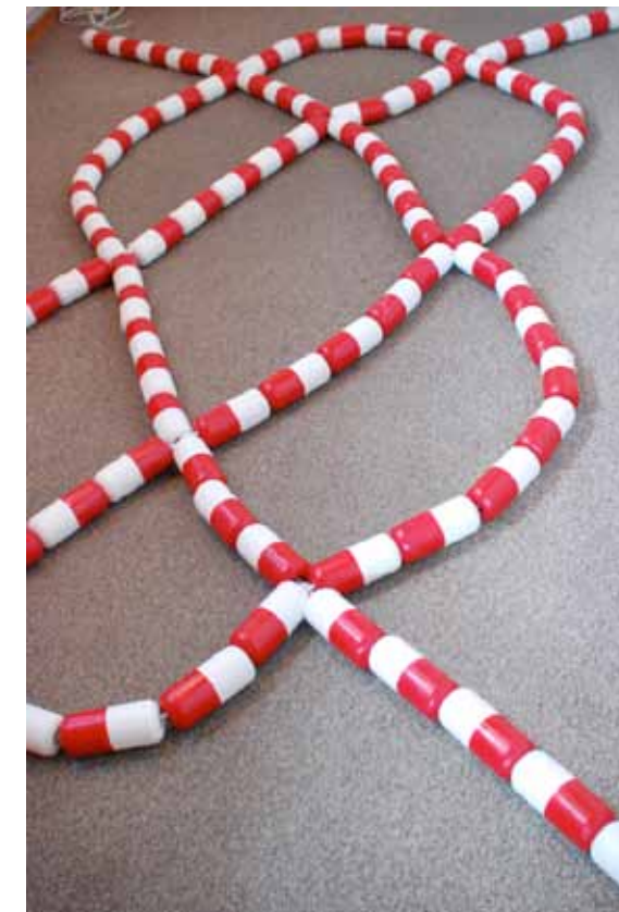
NODE OF CARRICK 2010