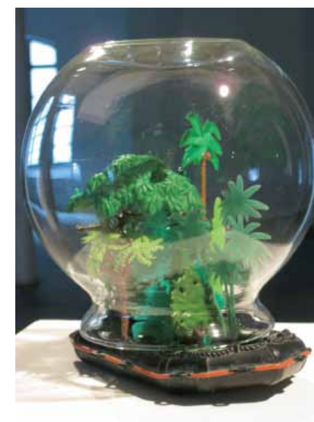
MODELS OF ARCHS 2008