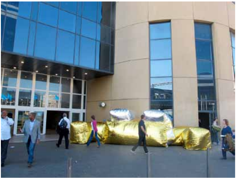
TODAYSART FESTIVAL 2011