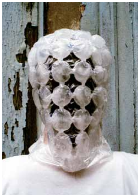
FROZEN 2006 ICY PICTURE