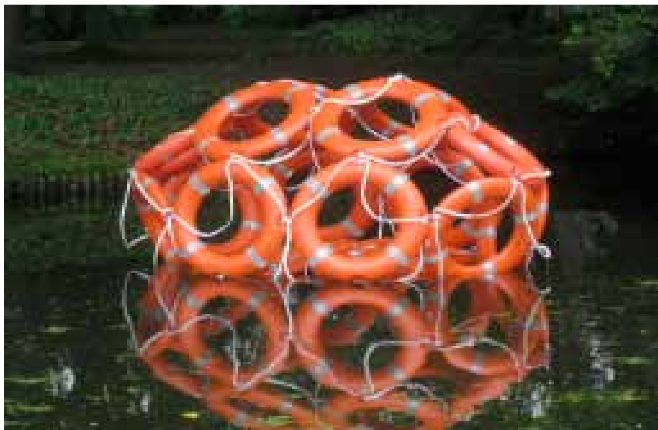
BATOMIUM 2010 200 CM X 100 CM