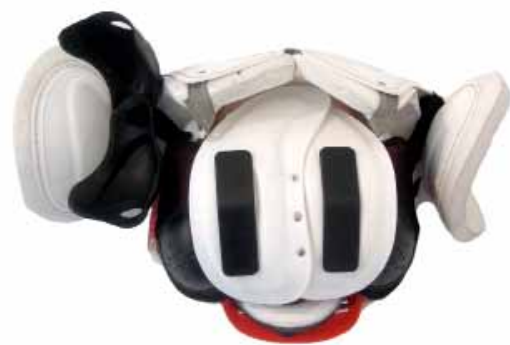
MICKEY AND MINNIE 2008