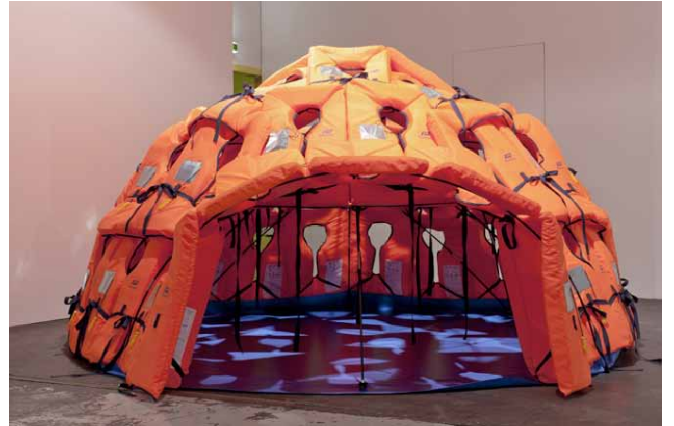
RESCUE IGLOO 2010 200CM X 200 CM X 140 CM

HOSPITAL WORK-WEAR, PLASTIC OVERSHOES, SURGICALGLOVES AND MASKS, SURGEONS BLOUSES, TRANSPARENT PLASTIC, LIGHT