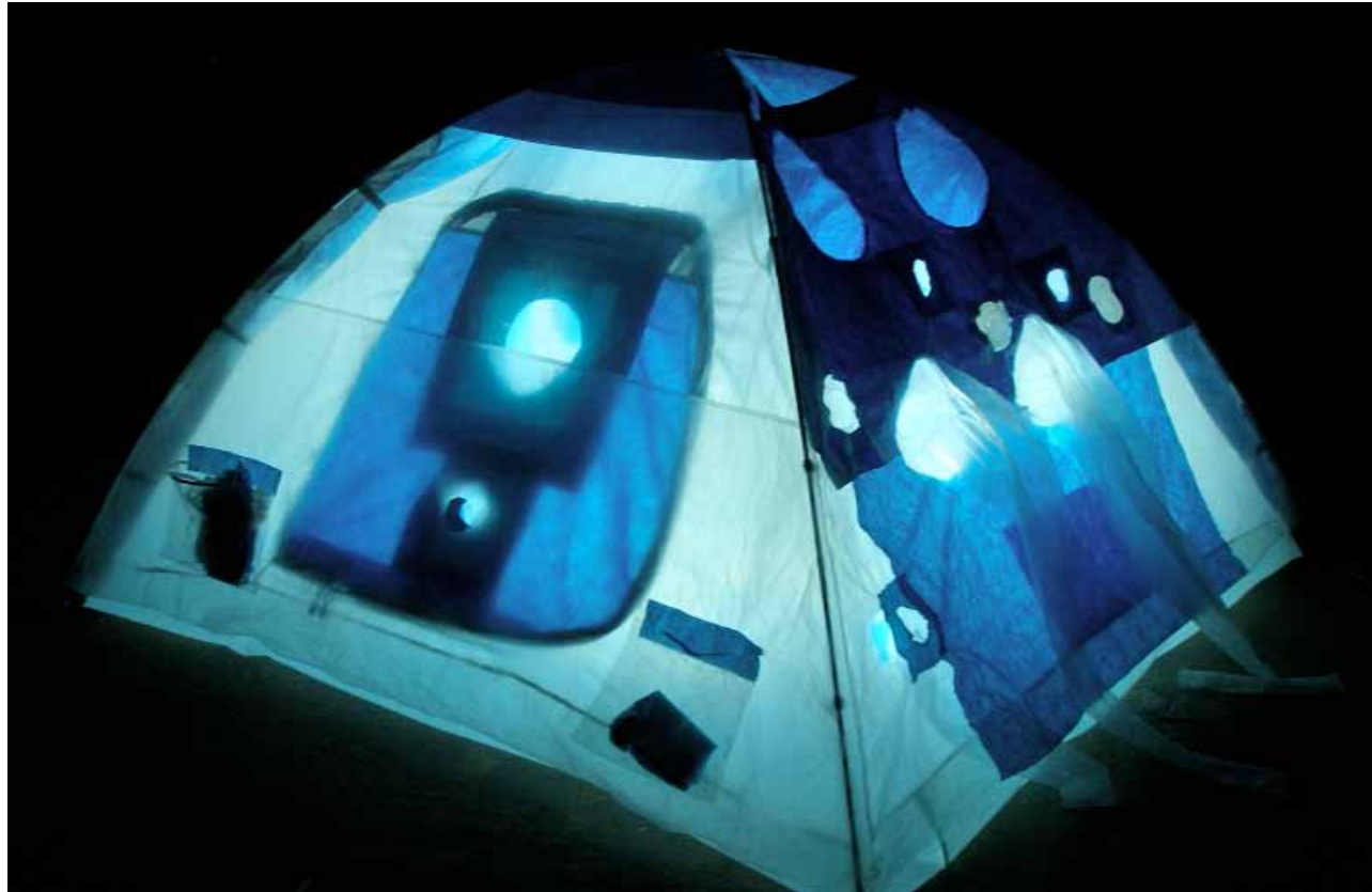
DOCTEUR MARTEN GIELEN 2007 200 CM X 200 CM X 140 CM

THIS SCULPTURE REPRESENTS A STERILE ROOM, A SPACE PROTECTED FROM EXTERNAL INTRUSIONS