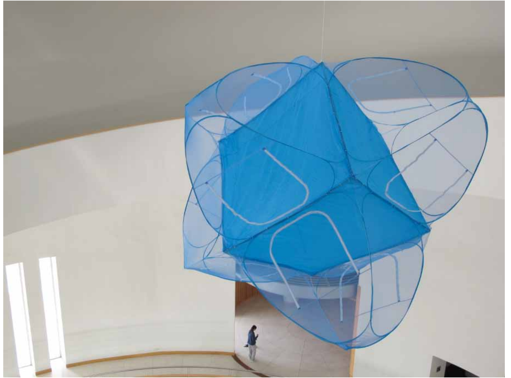
BANGKTAIHUA 2011 600CM X 600CM X 600 CM