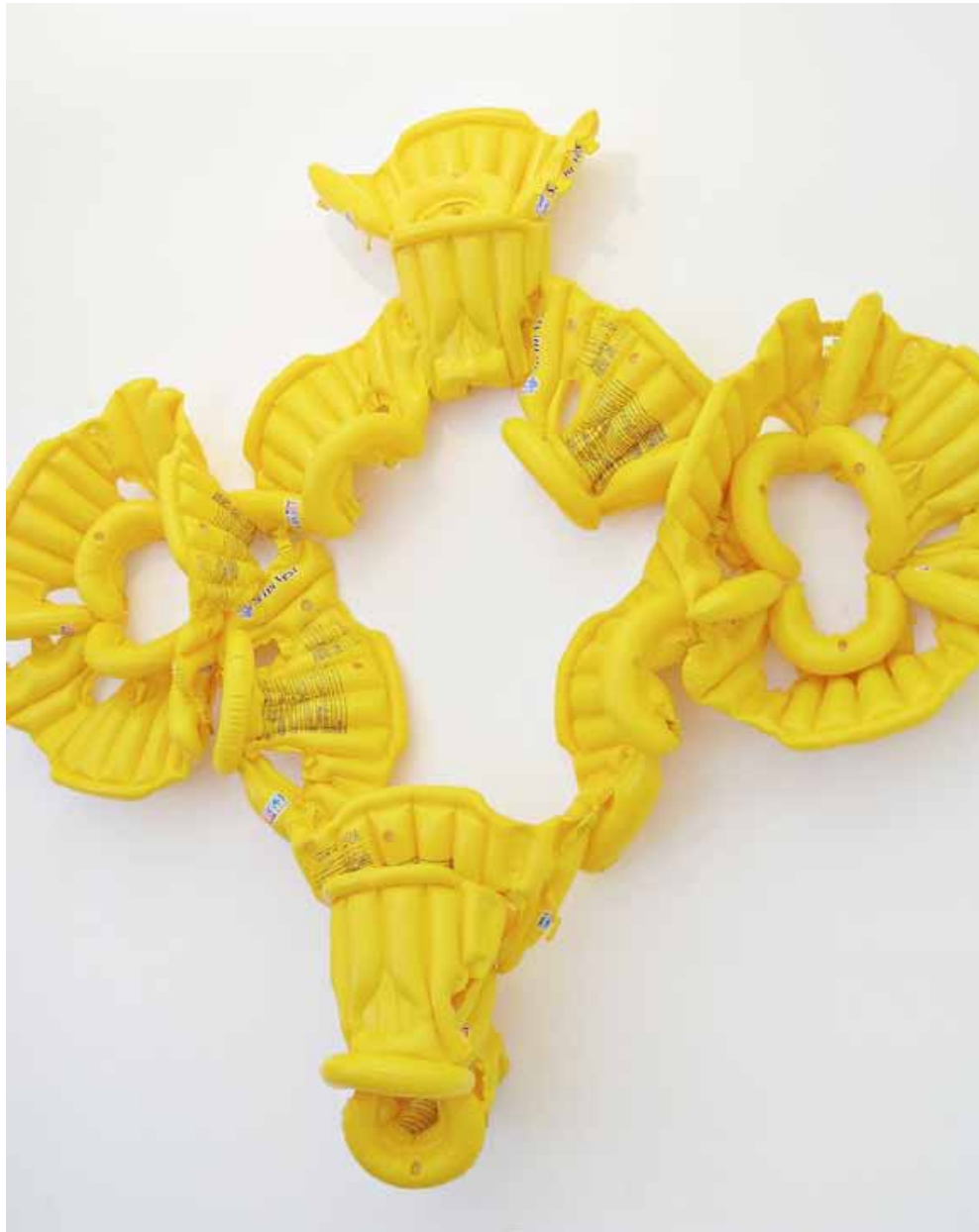
UTOPIA B 2010