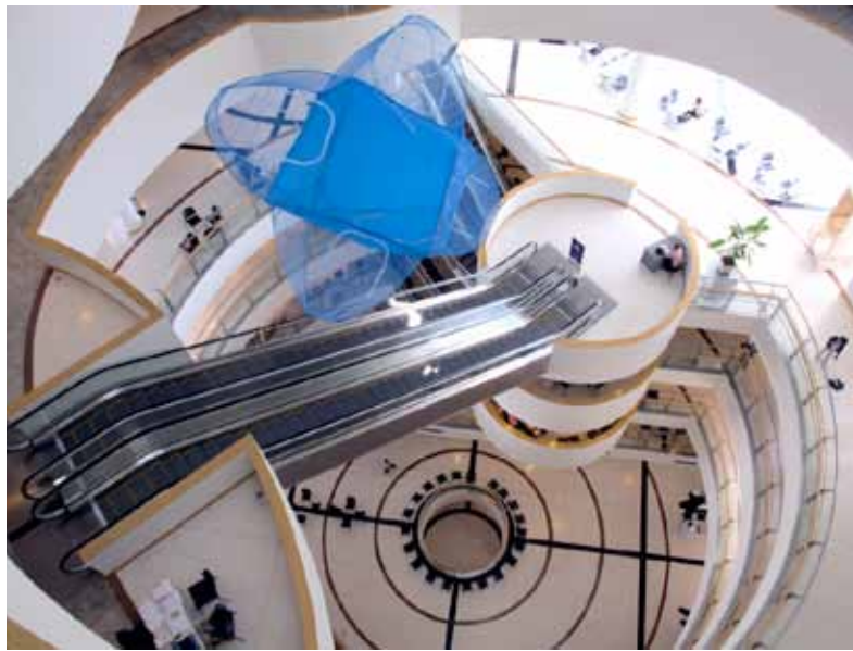
BANGKOK ART CULTUREL CENTER, THAILANDE