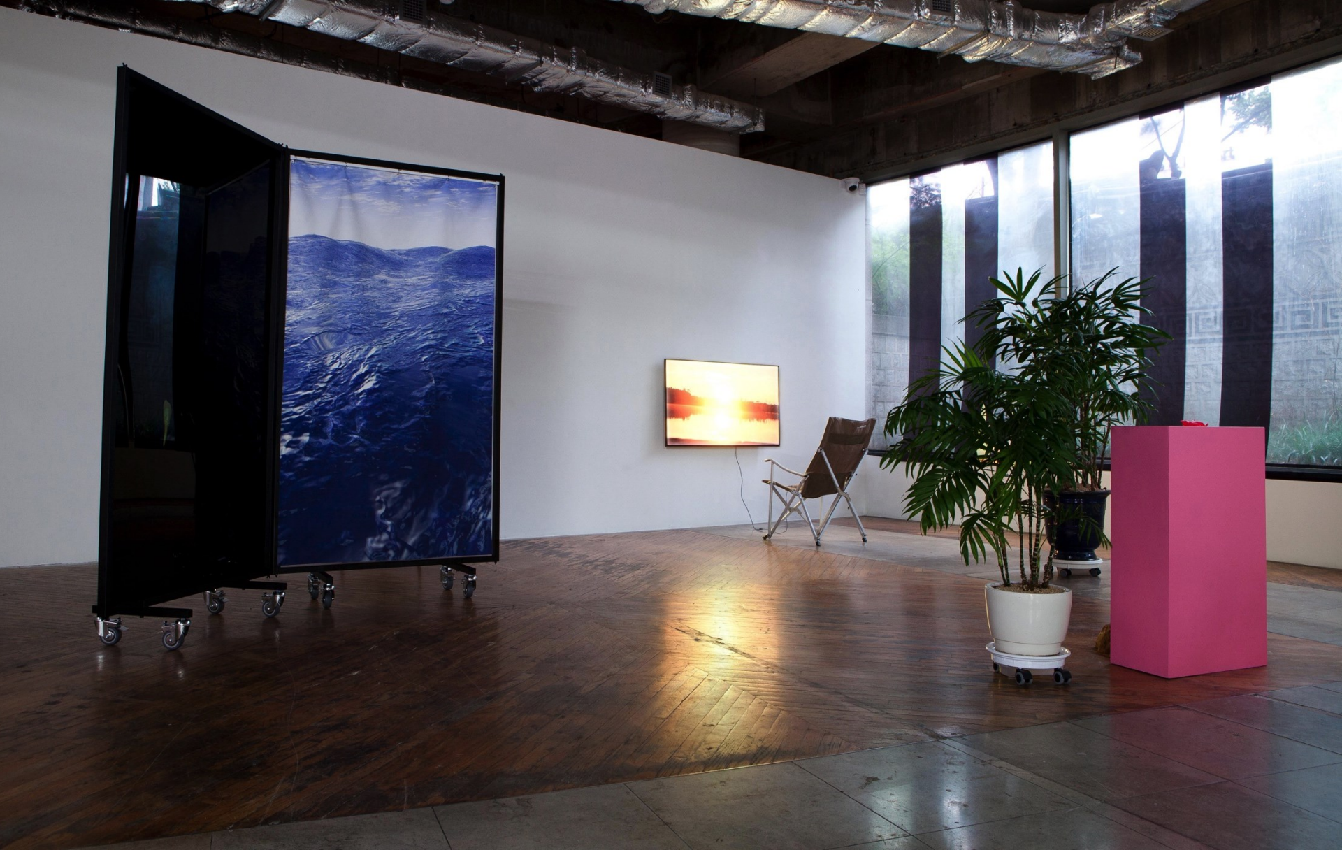
<All Exiles Have a Hidden Luck> solo exhibition view 'Wonderland' installation view_ 2015