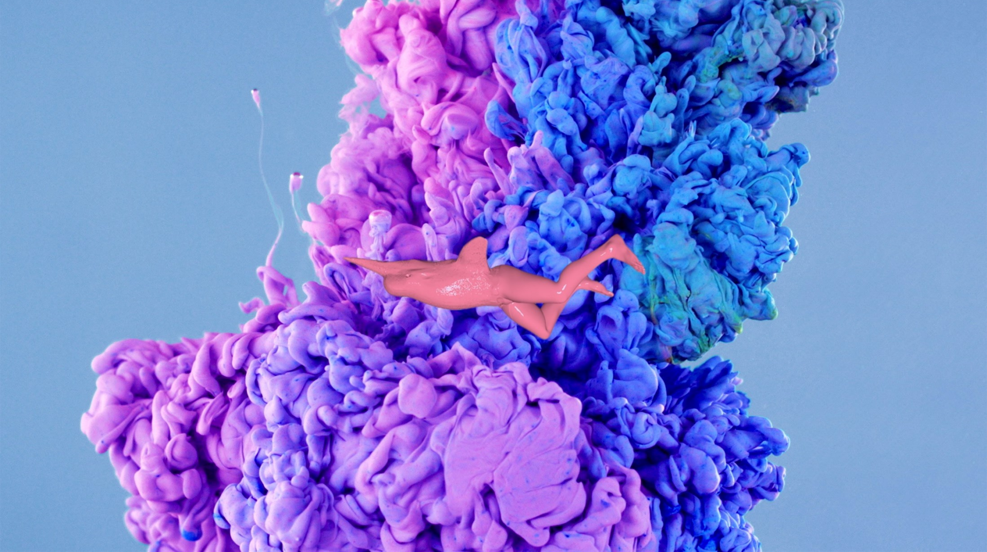
A Night with a Pink Dolphin

single channel moving image_ Canon 600D, Canon C300, Cinema 4D, Found footage_ 21' 47" _ 2015