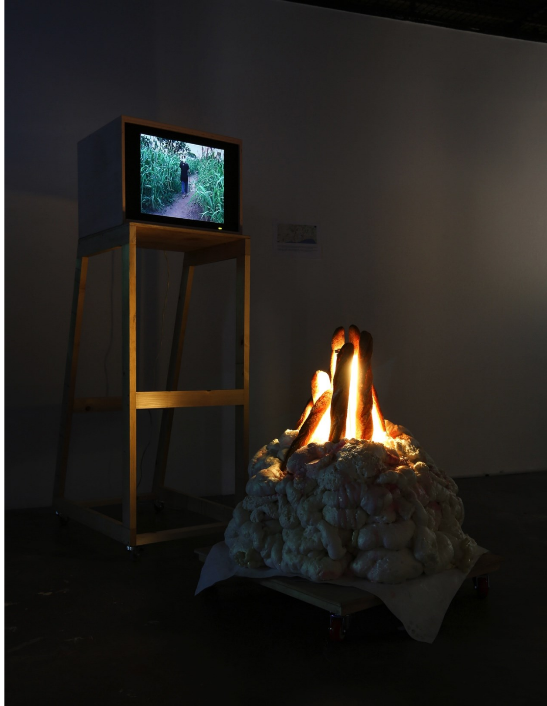
<Video & Media> group exhibition view Solmier (A foreigner)_ video installation_ urethane foam, light, bread, wooden-frame_ 180x100x70cm_ 2013