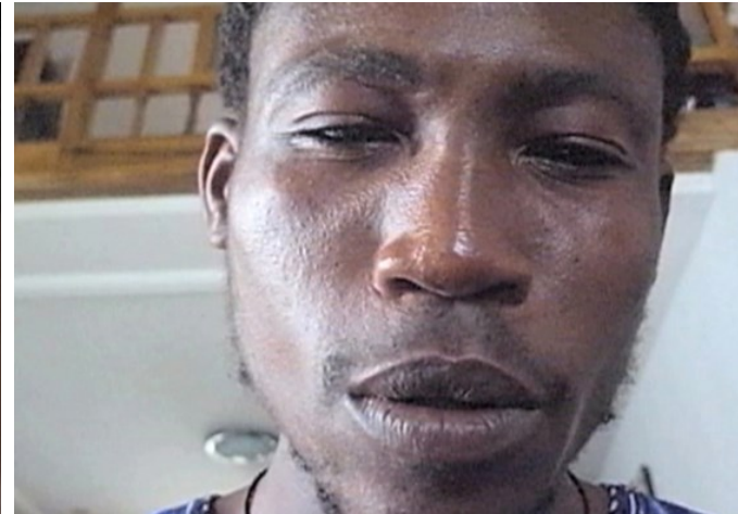
In search of a mysterious traveller's face single channel video_ Ricoh GX200, Panasonic NV-MX500KR_ 09' 30" _ 2011