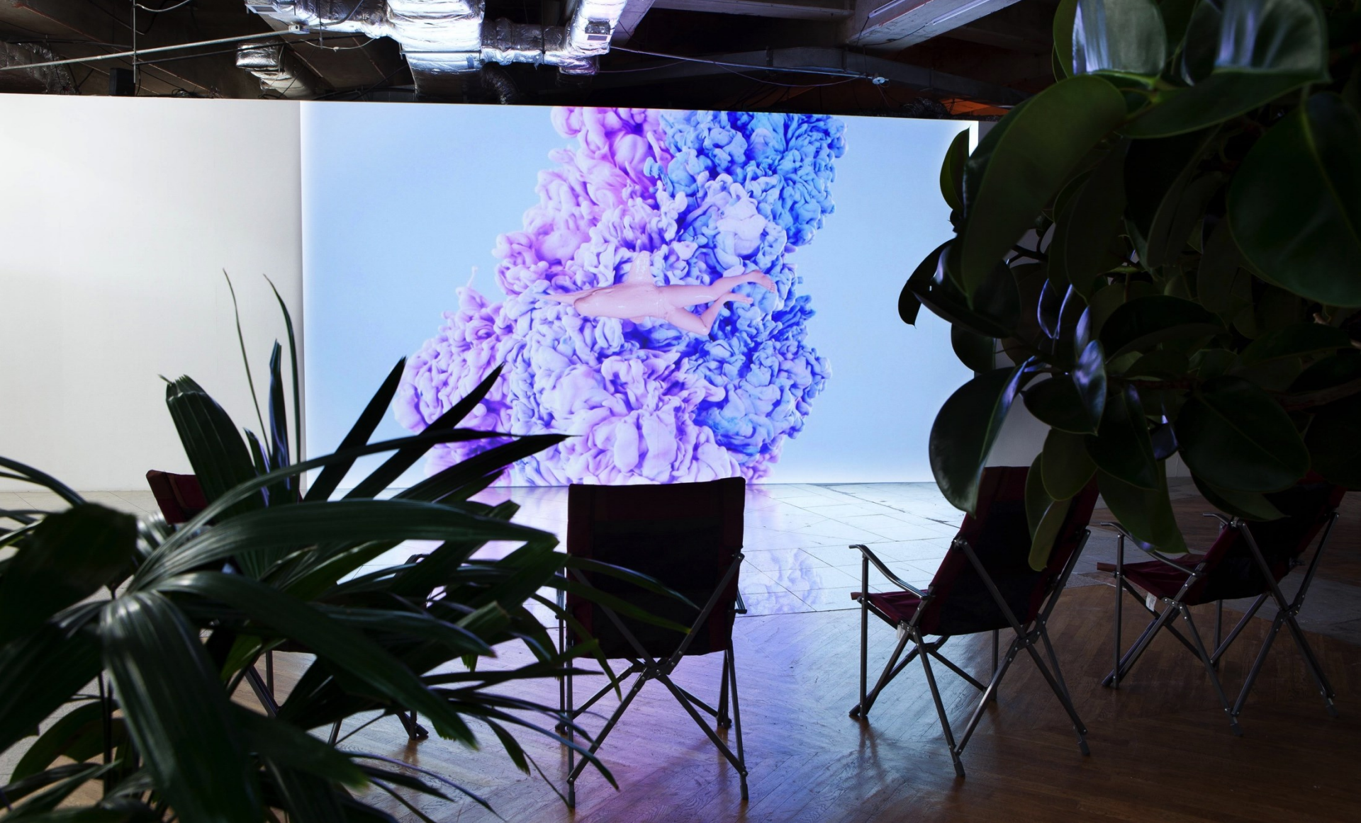
<All Exiles Have a Hidden Luck> solo exhibition view 'A Night with a Pink Dolphin' installed with the rubber tree_ 2015