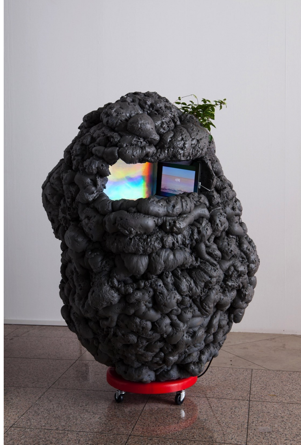
<All Exiles Have a Hidden Luck> solo exhibition view Isoland no.5_ moving image installation_ urethane foam, ipad, pot plant, caster_ 130x90x90cm_ 2015