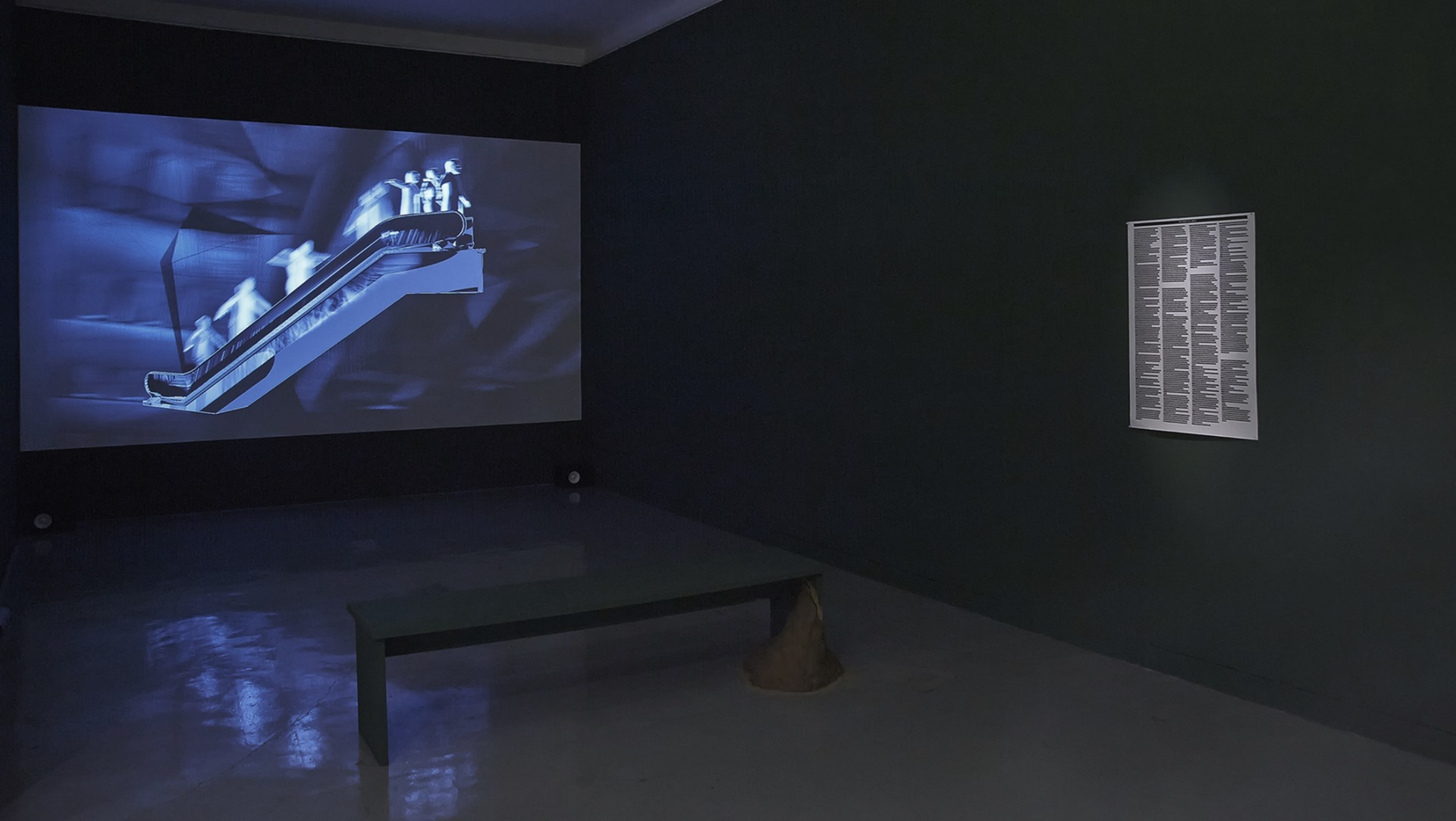
<The Sleepless> group exhibition view 'Where We Met Genius' and the wall text written by a novelist, Hae Yisoo_ 2015