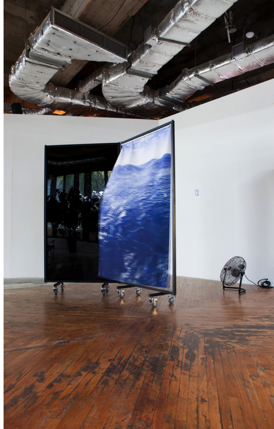
<All Exiles Have a Hidden Luck> solo exhibition view Black Mirror, Black River_ installation_ steel-frame structure, acrylic panel, digital print, fan_180x200x20cm_ 2015