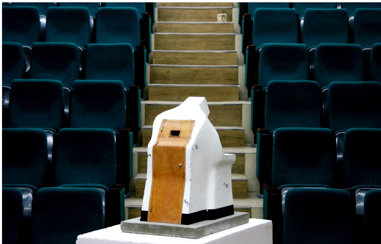
Single #3 cement, wood, paint, stainless steel 43x32x60cm 2006