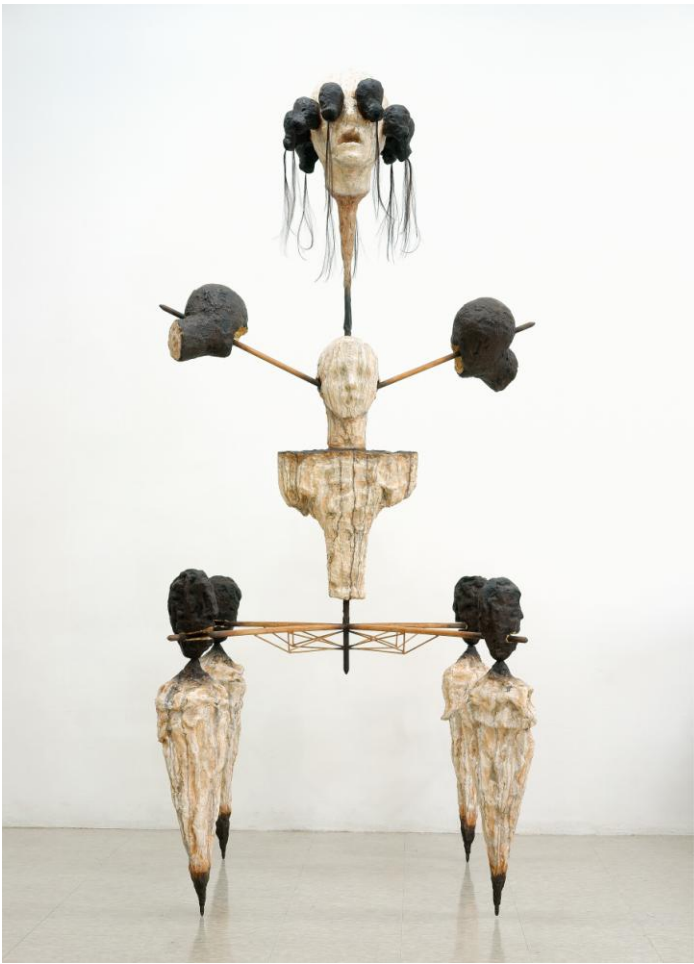
Familiar Conflict resin, acrylic, steel, wig 110x100x230cm 2016