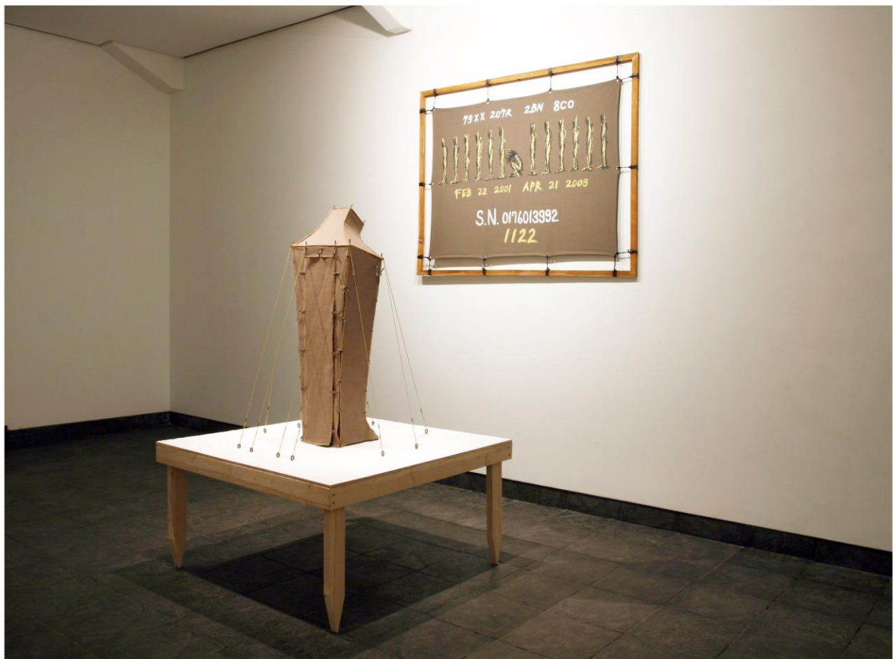
Single #7 fabric, steel, wood, thread, salt 120x120x140cm 2009