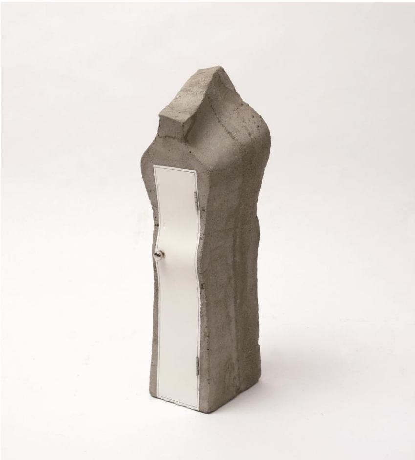
The room of love cement, paint, stainless steel 13x15x42cm 2008