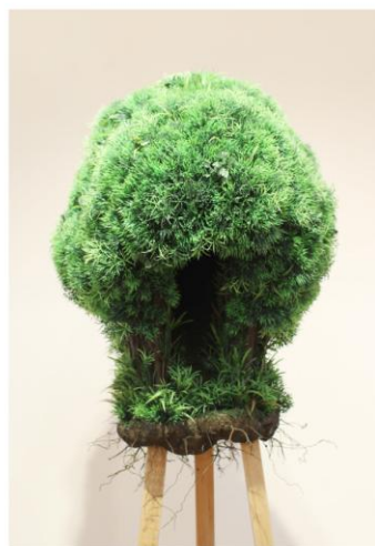
Single #14 mixed media 120x60x185cm, 90x65cm 2011