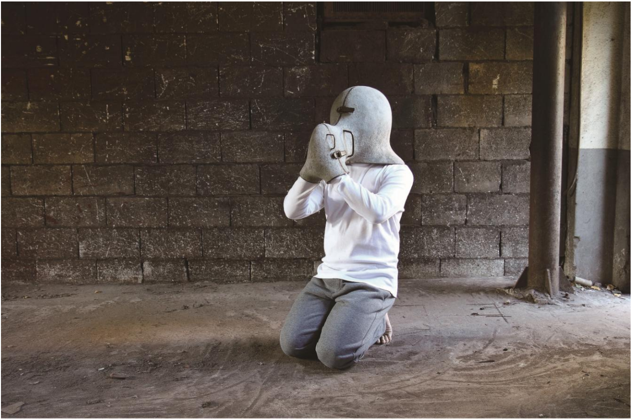
Confined One #3 photograph variable size 2008