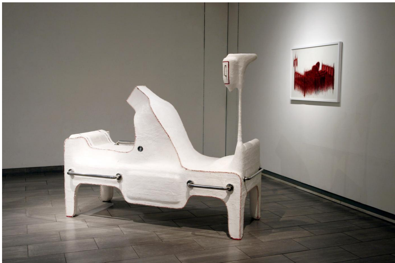
Single #5 plaster bandage, styrofoam, plaster, stainless steel, acrylic, thread 210x100x180cm 2006