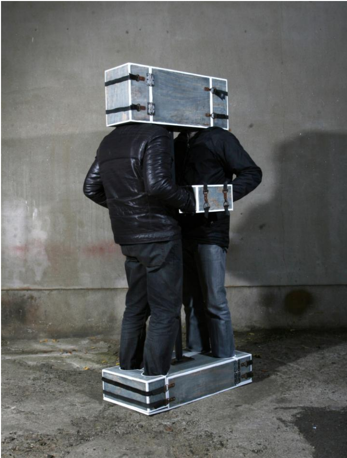
Equipment #2 photograph 42x50cm 2010