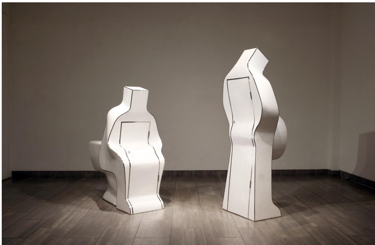
Single #1, #2 (from right) plaster, stainless, paint 80x75x183cm, 90x110x150cm 2010