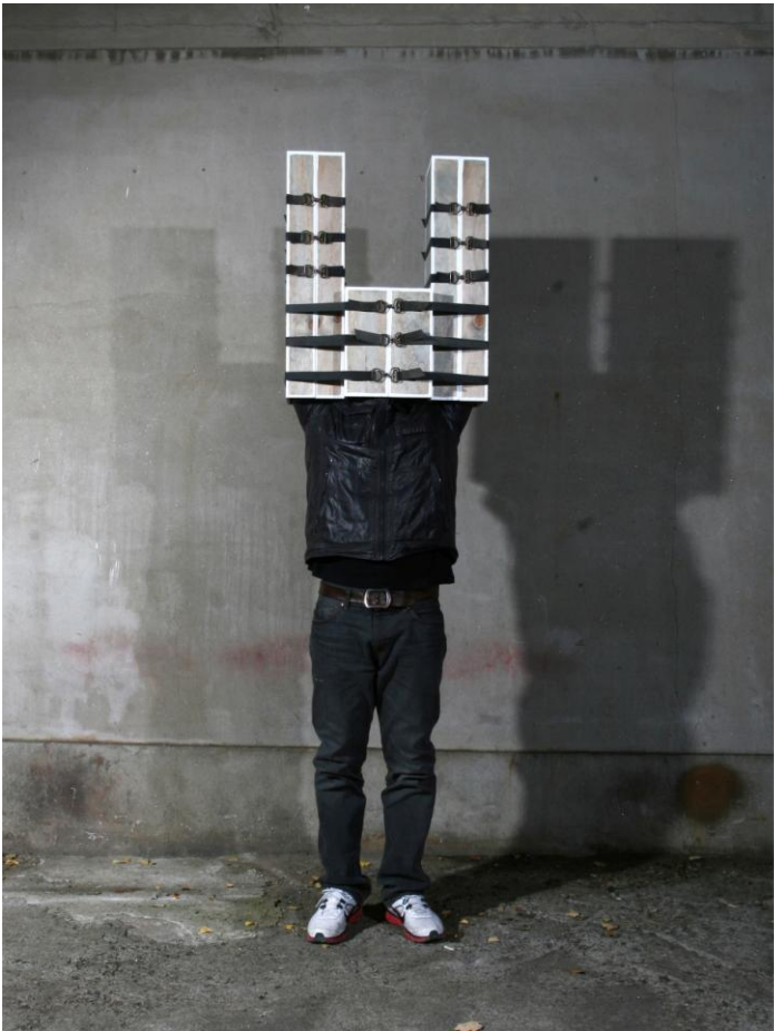
Equipment #1 photograph 39x52cm 2010