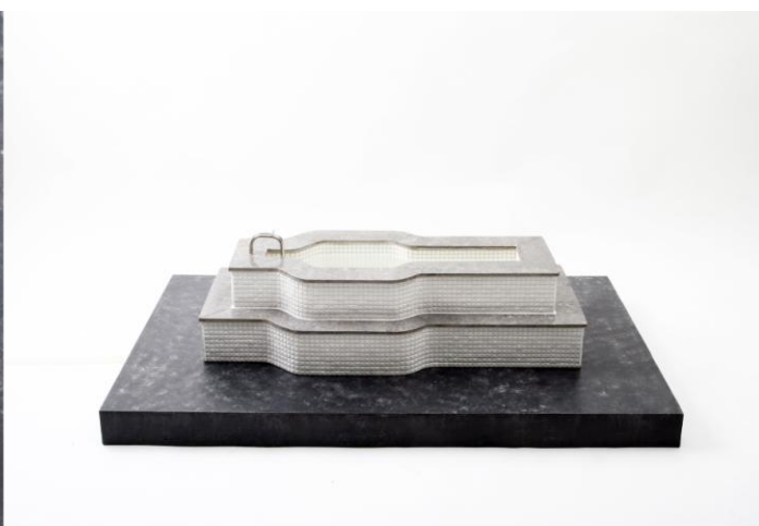
Single #6 tile, stainless steel, resin, water, air pump 120x90x35cm 2009