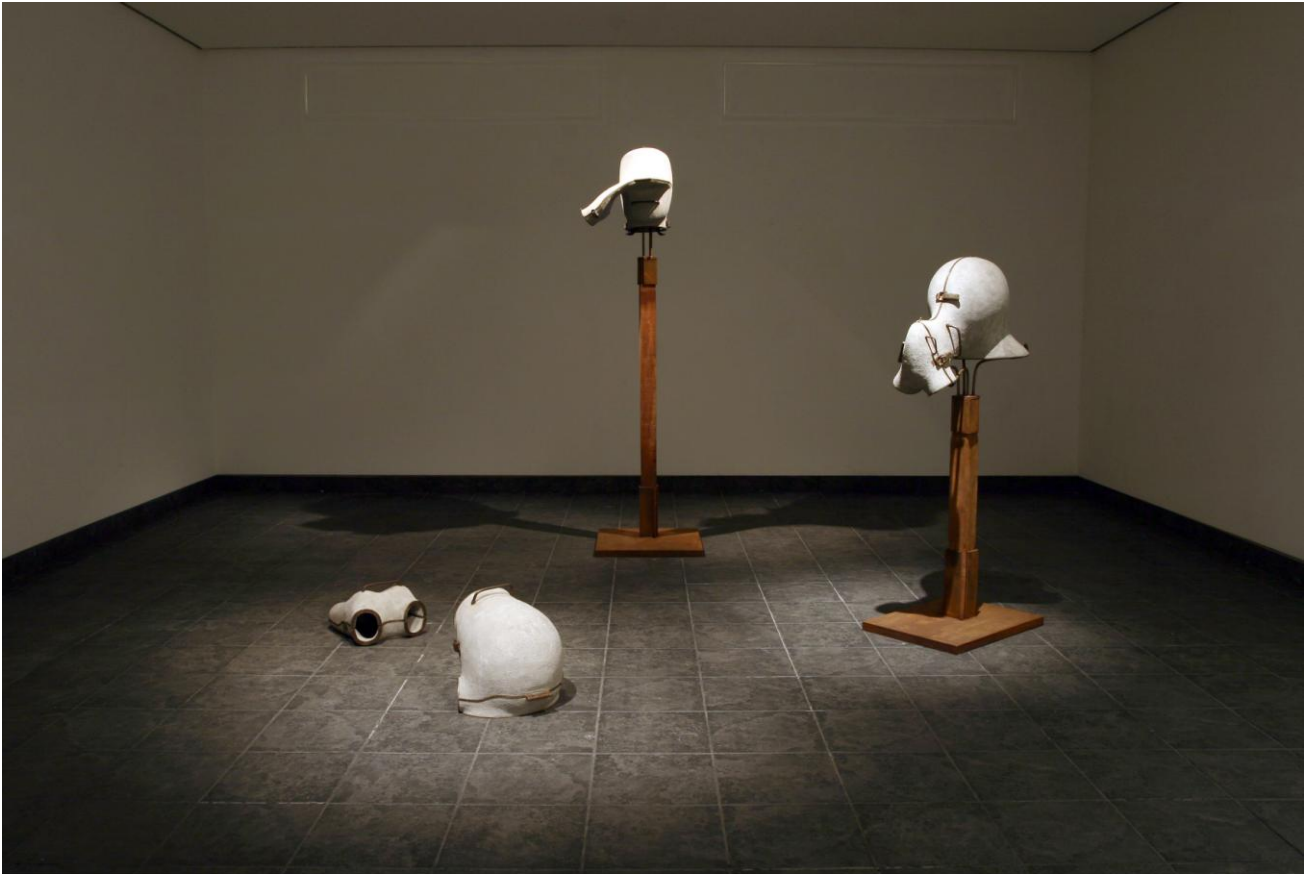
Confined One #3, #2, #4 (from right) cement, steel, wood 55x40x125cm, 50x55x167cm, 33x110x35cm 2008