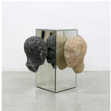
Familiar Conflict mirror, plaster bandage, acrylic, wood, steel 60x 75x75cm 2016