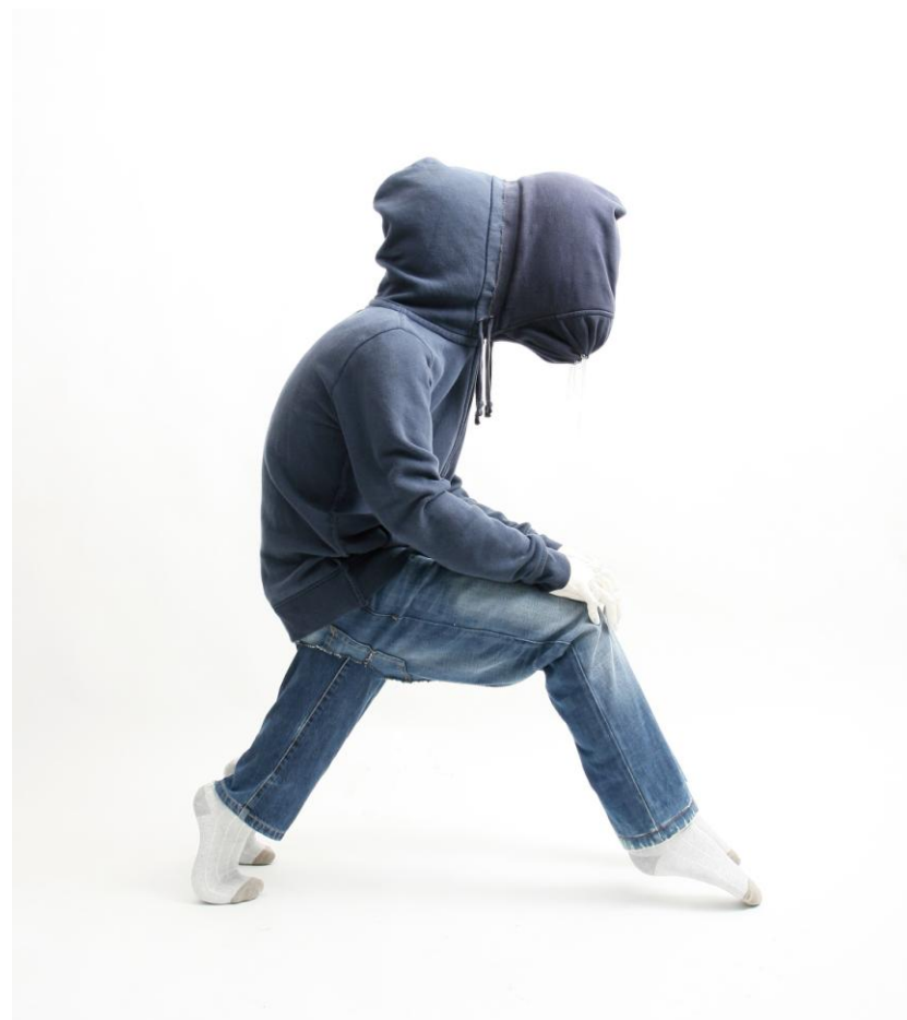
Solitude mixed media 90x55x130cm 2012