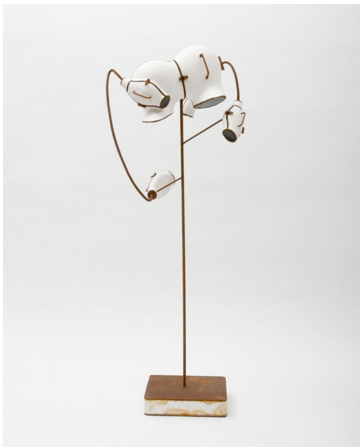
Confined One #5 plaster, steel, acrylic 48x23x90cm 2008